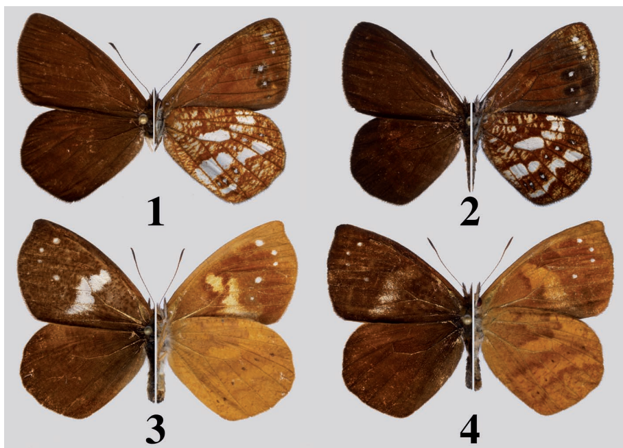
1-4. Adults (left: dorsum, right: venter): 1 – Lymanopoda labda bilinskii holotype male, 2 – L. labda labda male, El Retiro, 3– L. labineta wojtusiaki holotype male, 4 – L. labineta wojtusiaki form, paratype male

ECUADOR: HOLOTYPE (male): Prov. Napo, Baeza, Río Horituyacu, 1800 m, 08.VI.1999, T. Pyrcz leg. [MZUJ]; PARATYPES (35 males): 2 males: Prov. Napo, Cuyuja, 1800 m, 05.XI.1989, 4 males: same data but 02.II.2004, P. Boyer leg. [PBF]; 1 male: Prov. Napo, San Isidro, 02.XII.1996, P. Boyer leg., prep. genit. 02/14.03.2011 J.Lorenc; 1 male: Prov. Napo, Baeza environs, 2050-2250 m, 13.IX.1995, A. Jasiński leg.; 3 males: Prov. Napo, Baeza, 1800 m, IX.1996, P. Boyer leg.; 5 males: Prov. Napo, San Isidro, 2000 m, 08.XII.1996, P. Boyer leg.; 2 males: Prov. Napo, Baeza