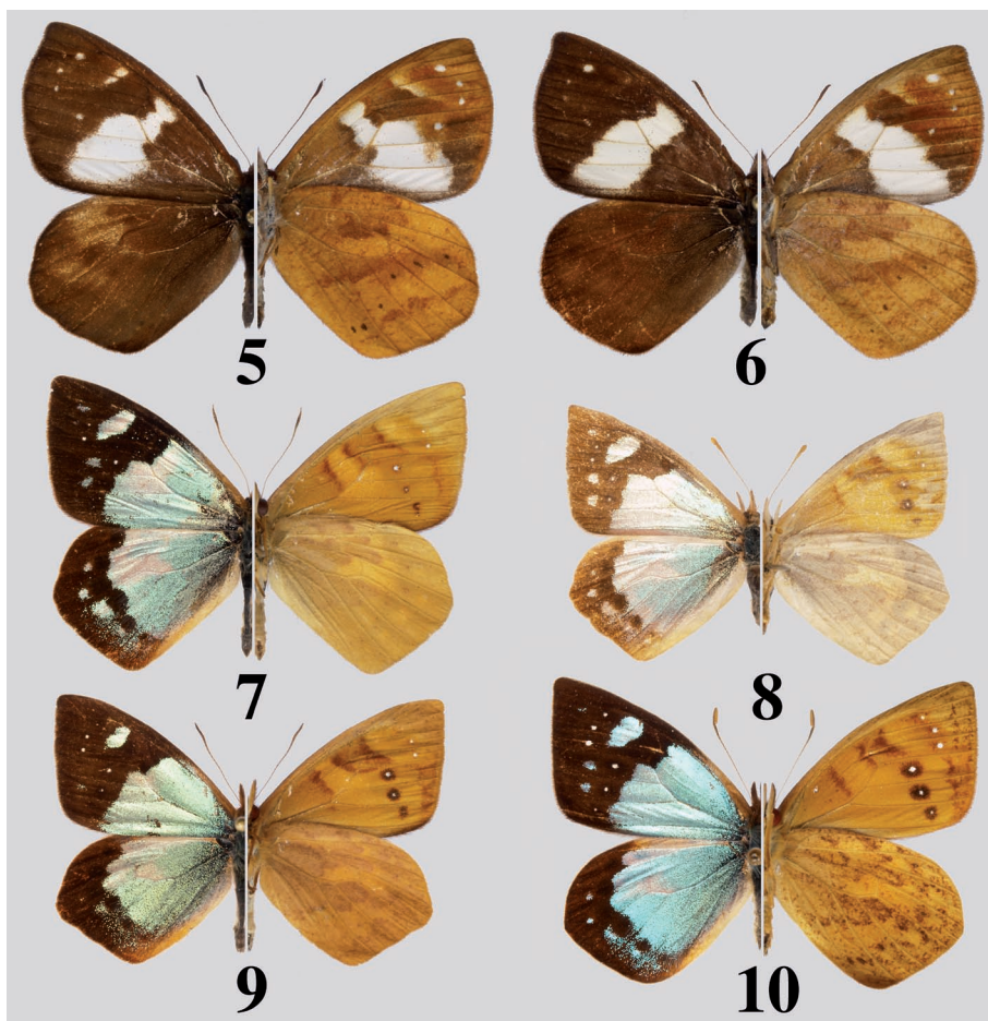
5-10. Adults (left: dorsum, right: venter): 5 – Lymanopoda labineta decorata male, via La Bonita, 6 – L. labineta labineta male, Gualaceo – Limón, 7 – L. hazelana viridia holotype male, 8 – L. hazelana viridia paratype female, 9 – L. hazelana hazelana male, above Gualaceo, 10 – L. hazelana summa male, Loja - Zamora

environs, 2050-2200 m, 02.X.1995, A. Neild leg. (1 male prep. genit. 1010/104 T. Pyrcz); 2 males: Prov. Napo, Baeza – Papallacta, 2100 m, 07.IV.1998, A. Neild leg.; 1 male: no locality; 1 male: Baeza; 1 male: Baeza, V.1996; 1 male: Baeza, XII.1995; 1 male: Sierra de Huacamayas; 1 male: same data but 06.II.2005; 1 male: Prov. Napo, via Papallacta, Chalpi Grande, 2700-2750 m, 18.I.2004, T. Pyrcz leg.; 6 males: Prov. Napo, Baeza, Rio Horituyacu, 1800 m, 08.VI.1999, T. Pyrcz leg. [MZUJ]; 2 males: Prov. Napo, Baeza – Tena, Reserva Yanayacu, 2100-2200 m, 07-09.IX.2003, T. Pyrcz leg., to be deposited in [PUCE].